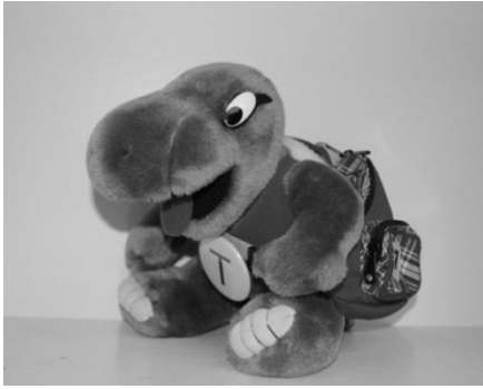
Timmy, the Terrible Hunger Terrapin