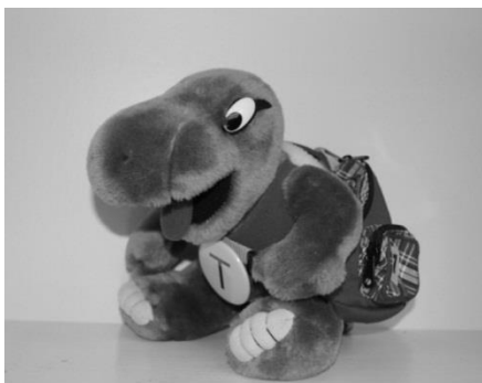
Timmy, the Terrible Hunger Terrapin