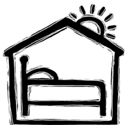
COLD WEATHER SHELTER

It is time to prepare for another season of service at the Cold Weather Shelter (CWS). The CWS provides a safe overnight refuge for the homeless who would otherwise be left out in the elements. November 15—March 31, 7:00 pm until 7:00 am, the Shelter opens every night, to allow those in need a warm place to sleep and a hot meal. Grace Lutheran has accepted the responsibility of providing a meal for the shelter one night per week during this time. We divide the duties of cooking casseroles and serving dinner at the shelter for the Shelter to allow people who would normally not be able to volunteer because of work or other commitments to become active with those in need.